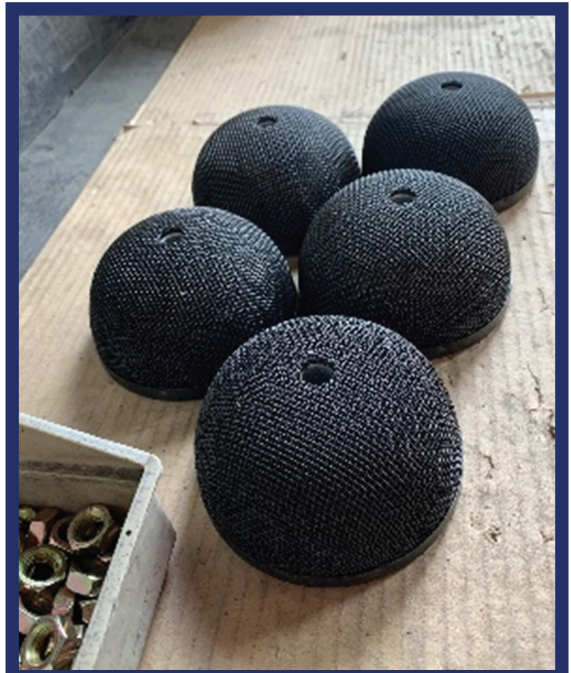
Flame Traps For Our 4" BICERA Legacy Valves