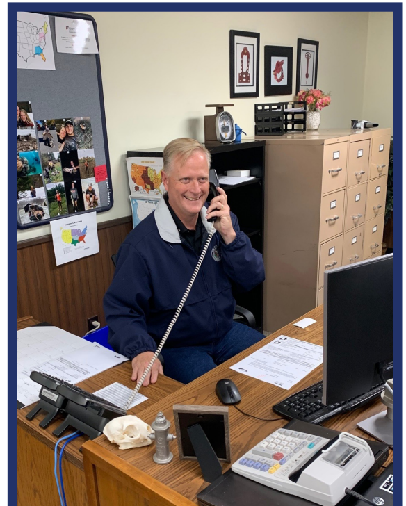
Congressman Fred Keller in the Penn-Troy offices.