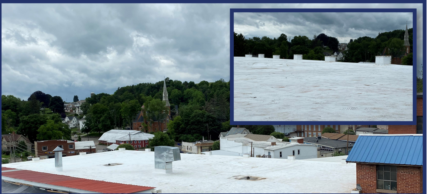
The new white roof coating is designed to help reduce temperatures in the machine shop during the summer months.