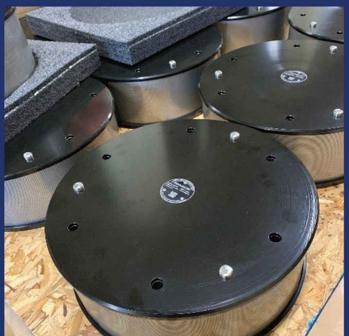
Completed Sigma 266ESR valves getting packaged for shipment