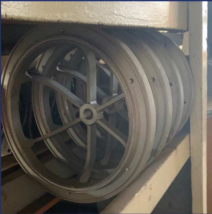
Aluminum Bicera valve carriers ready for assembly