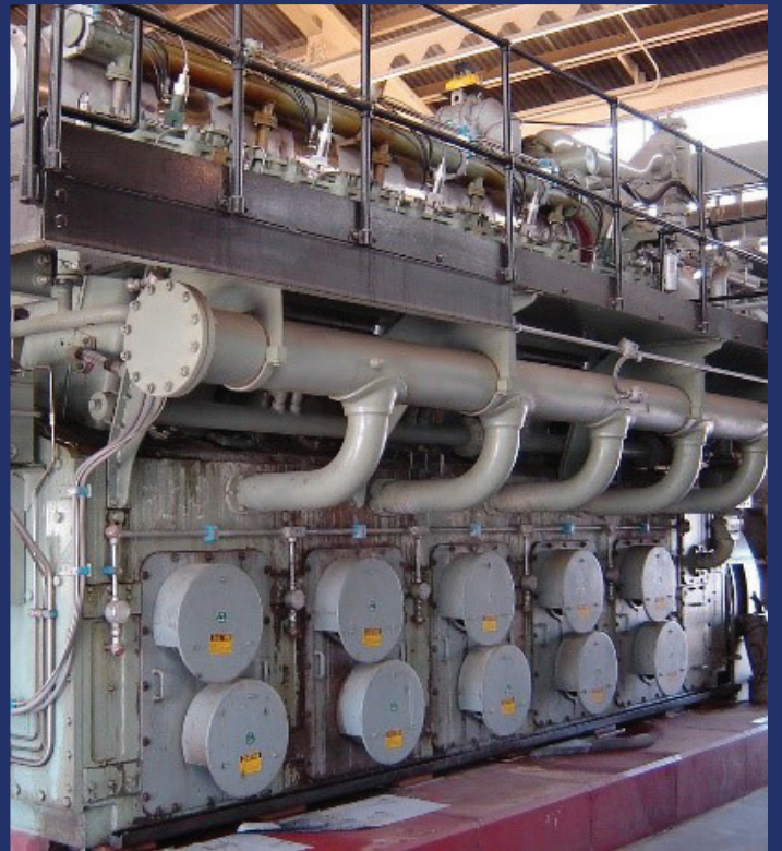
A customer shared image of Bicera Legacy valves on their engine