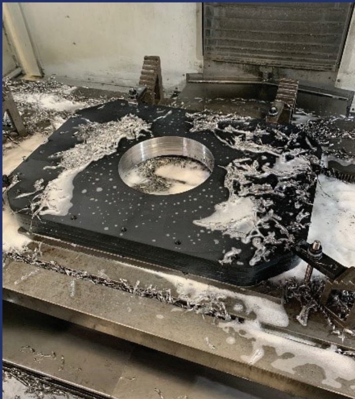
Machining inspection doors before mounting valves