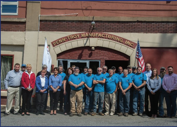
The Penn-Troy team