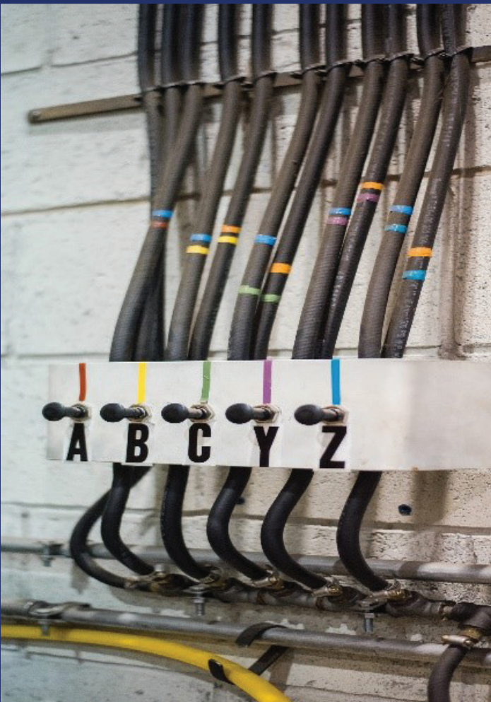
The valve control panel for our explosion room