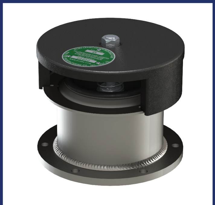
Bicera Legacy Series 4AB Valve