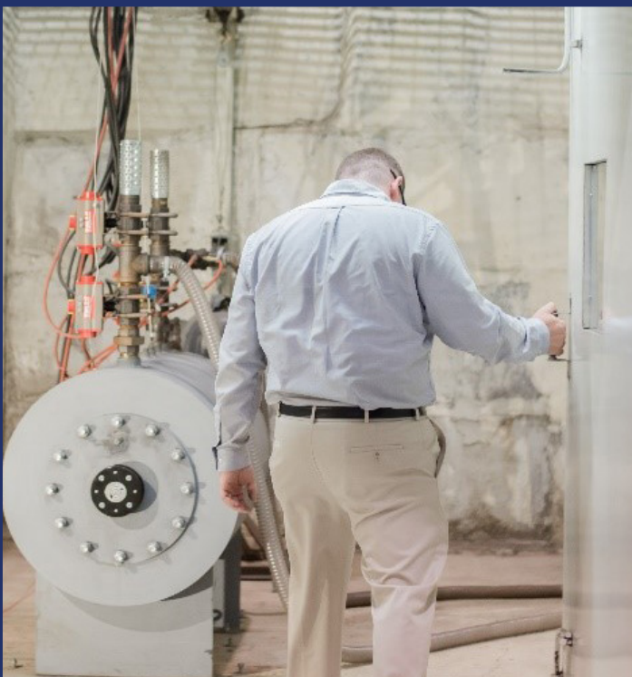
Preparing the Sigma 98 ESR for testing