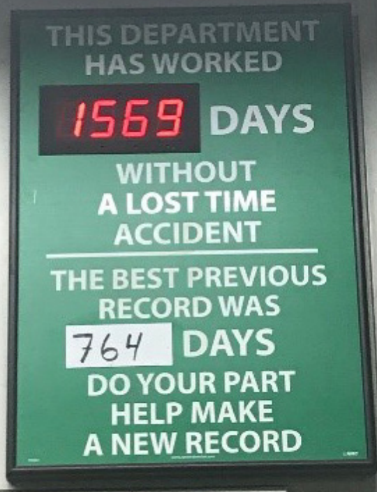
Safety is our priority