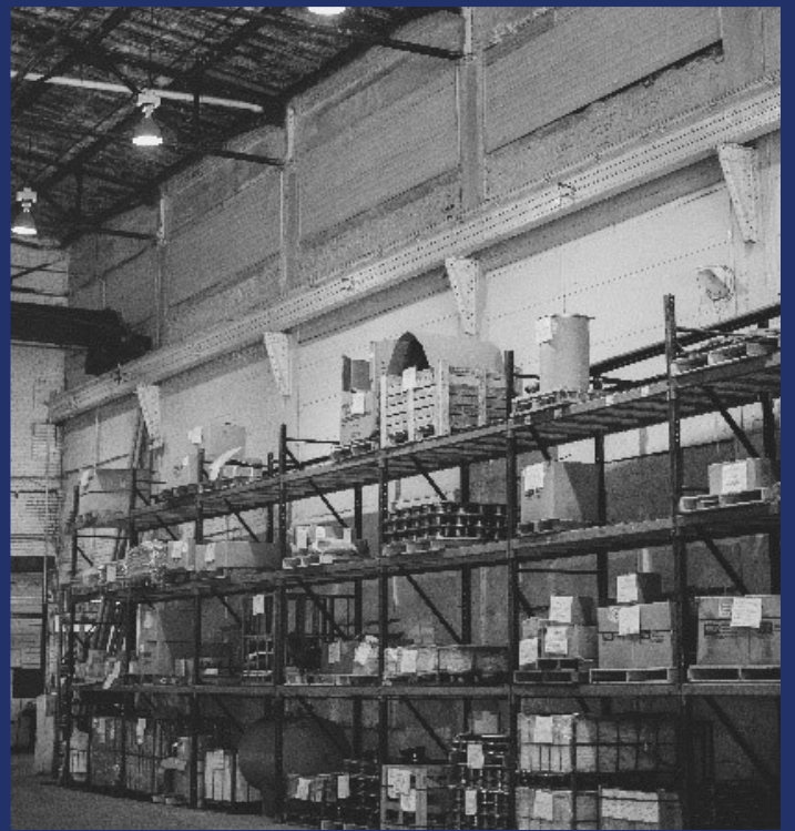
A small portion of our warehouse