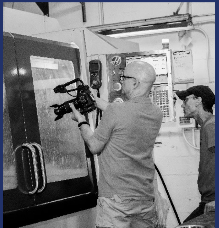
Behind the scenes of the making of our promotional video