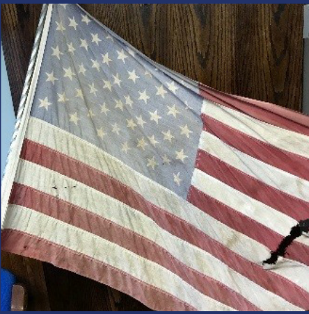
US flag found in our sprinkler room. Only has 48 stars. These flags were used from 1912-1959.