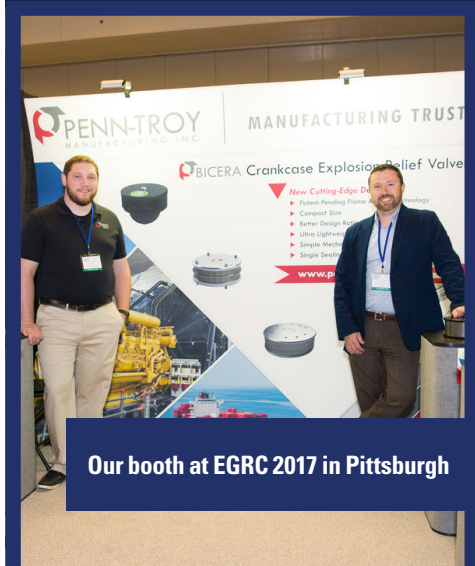
Our booth at EGRC 2017 in Pittsburgh